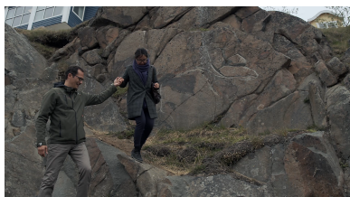
300 dpi stills